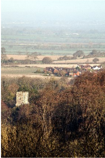
Great Kimble church and the vale

G The path takes you through a dense woodland of box trees.