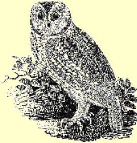
Tawny owl – boxwood print by Thomas Bewick © The Bewick Society

There are many other wonderful walks in the Chilterns: